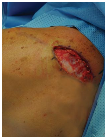
Figure 3. Oblique incision from superolateral to inferomedial aspect over superomedial border of scapula and ending at medial border of scapula spine.

After surgery, patients were placed in a shoulder immobilizer in slight abduction and neutral rotation to prevent periscapular muscle contraction. They were maintained in this brace, with removal for Codman exercises several times a day, for 2 weeks. Then passive and active assisted range of motion was initiated. Gentle strengthening was started at week 8 and continued until 12 weeks after surgery, when resistive exercises began. Patients usually return to sports 4 to 6 months after surgery, when proper thoracic posture, scapular control, and strength are obtained. 12